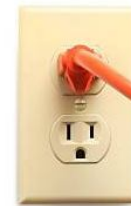
220V 50Hz AC