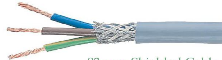
03 core Shielded Cable